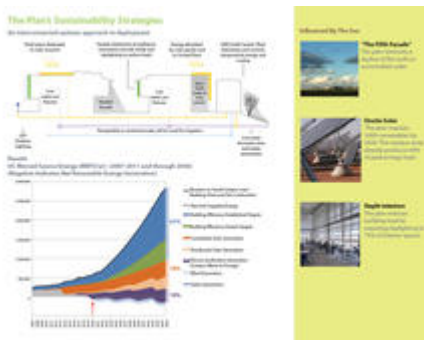
Sustainability Strategies -