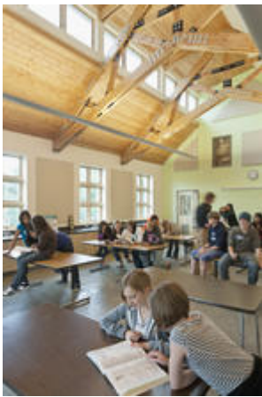
Clerestory windows bring in ample natural daylight