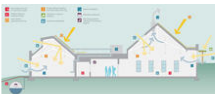
Light and air flow diagram - Photo Credit: Opsis Architecture

To achieve the optimum level of daylight in the science and music classrooms and energy efficiency, the project team performed multiple detailed daylighting studies. The resulting design combines translucent skylights, clerestory windows and traditional windows with deciduous vines for seasonal shading, allowing views in multiple directions from most building locations. Light-colored acoustic panels help reflect natural light from the clerestory windows deep into the classroom space. Fresh air is provided by a system combining operable low and high clerestory windows and rooftop ventilators to allow cross and stack ventilation.