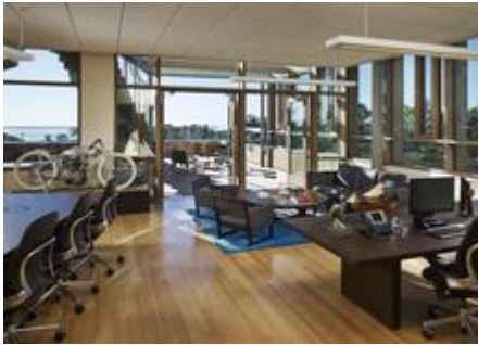
Executive office shows interior finishes against a backdrop of sea and Ecological Reserve vistas.