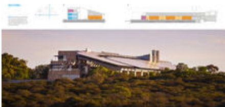
Additional building sections - Photo Credit: © Nick Merrick