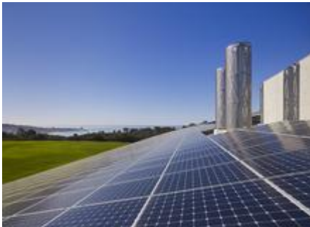
Photovoltaic panels help power the building.

The project's NZE approach led to several integrate strategies. First, unlike buildings that use electricity for cooling, then reject building heat into the atmosphere, and burn gas at night for heat generation, this project utilizes a 50,000-gallon Thermal Energy Storage (TES) system as the primary conditioning driver. Cooling towers cool the TES at night; allowing the building to be conditioned most days without electrical chillers. As cooling is drawn out of the TES, it's replaced with warm water that can be used at night for heating purposes. Additionally, reject heating is captured from a separate water loop feeding a water-cooled, low temperature (-80F) freezer farm, and an exhaust air heat recovery from the laboratory exhaust air. This is one of the few buildings, and the only laboratory in California, that does NOT have a natural gas line extended to it, meaning no on-site burning of fossil fuels is taking place to generate heat or for other uses, except for the diesel fire generator, used for life safety and minimal stand-by power for laboratory equipment. Furthermore, a large photovoltaic array is sized to over-produce most of the year, pushing energy into the grid and putting the NZE goal within reach.