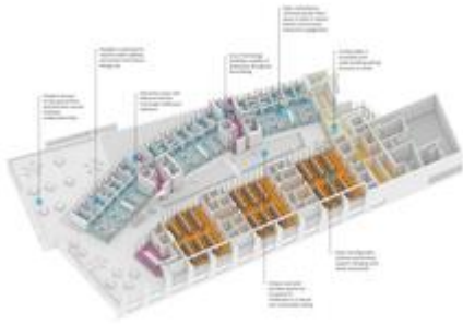
Axon of interior spaces shows how sustainability features were applied.