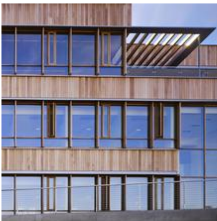
Operable windows shown from exterior.

Regardless of one's location in the building, each occupant can maintain a connection to nature via unobstructed views outdoors through large windows. Even the garage has openings that allow for its natural ventilation, while providing views out to the landscaped grounds and natural surroundings. Office occupants have views north or to the courtyard. Laboratory occupants have views south and also into the courtyard. The windows that look into the courtyard, also provide connections among occupants. The use of overhangs and shading devices, in combination with automatic and manual shades that mitigate glare issues, provide day-lit spaces, even on a cloudy day, such that 80-90% of the occupants rely solely on daylight during daylight hours. Occupant control features include over-ride of the automatic shades, light-level control down to an office level, and operable windows in all office areas. Conditioning only the ventilation air required for the space, allowed for the use of a 100% OSA system for the offices. Internal and external loads are mitigated via hydronic heating and cooling, primarily via induction beams—chilled beams that have cooling and heating capabilities.