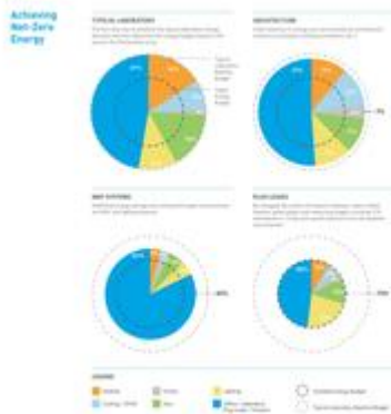
Energy diagrams.