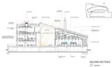
Building section with overlay of air system and sun angles.

The deliberate inclusion of large windows in both wings, even in the laboratories, also meant compensating for glare at certain times of the day. The set of deep eaves on the southern exposure minimizes the hours of direct sunlight into the laboratories, while still admitting ample daylight onto the benches even on cloudy days. Two arrays comprising 26,124 SF of photovoltaic surface serve as both an energy source and a shade structure, leveraging the resource and mitigating the challenge of sunny Southern California days. The PV array was configured to provide shading of the western patio area, while the PV panel over the interior courtyard provides a diffused light into the space and allows reflective light off the concrete walls to 'bounce' light into the northern benches of the laboratories. It is predicted that the arrays will exceed the building demand, pushing excess power generated back into the grid. Spanish cedar, often used to build boats, was used in the exterior wood wall system. Not only will this wood stand up to the seaside climate, but it will age naturally, without the use of harsh chemicals.