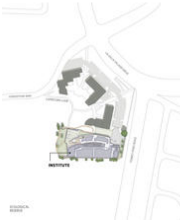
Site plan shows relationship of Institute to Reserve, neighborhood, streets, and future buildings.

Site improvements were based on design principles developed in the Scripps Institution of Oceanography Upper Mesa Neighborhood Planning Study. Recognizing that the site's primary advantage was its view of the ocean and adjacent Ecological Reserve, the building's orientation and landscape design were planned to highlight these features and create positive connections to the immediate neighborhood, while responding to local climate and site influences. The building's configuration on the site also provides the groundwork for linking the building's terrace and first level to a future promenade and to future UCSD research buildings. Also considered was public access around and through the site via all-weather paths. And, since water conservation is a prime driver in the San Diego region, in addition to a 60% reduction in domestic water consumption, the facility also utilizes captured stormwater for reuse in the toilets and cooling tower, as well as drought resistant landscaping. Finally, the facility is pre-piped to allow the use of regional reuse water, once put into operation by the City.