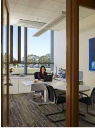
Private office with ample daylight and operable windows.