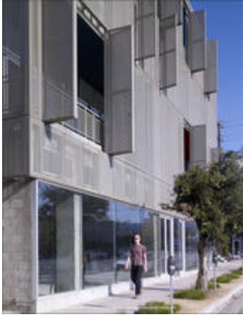
A detail view of the retail space and facade system are seen in this photo, including a planted median with an underground stormwater retention system.