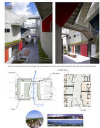
Two photos show views of the central courtyard (above).