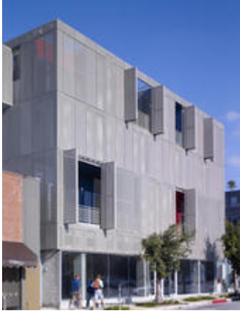
A street view looking northwest is shown in the photo.

This urban infill, mixed-use, market-rate housing project was designed to incorporate green design as a way of marketing a green lifestyle. It is pending LEED Platinum certification. The design maximizes the opportunities of the mild Southern California climate with a passive cooling strategy using cross-ventilation and thermal convection while taking advantage of the abundantly sunny location. A commitment to minimizing the project's ecological footprint informed all aspects of the design.