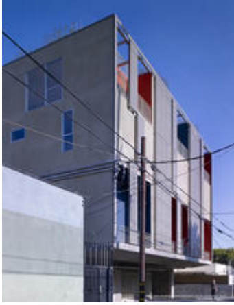
The view from the alley, as seen in the photo, shows shaded balconies and the green roof above.