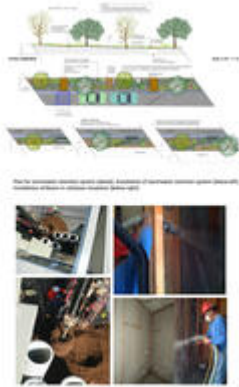
A computer rendering explains the stormwater retention system (above). Photos show installation of the stormwater system and blown-in cellulose insulation.

100% of storm water is captured on site. Most of the water is captured by the green roof and is returned to the groundwater after being cleaned of pollutants. All other storm water is collected in a subsurface infiltration system.