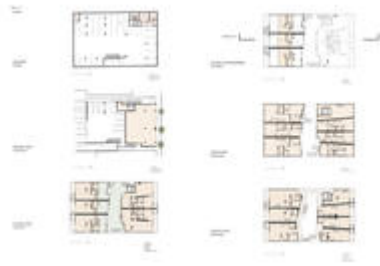
These drawings show floor plans of apartments and townhouses on each floor of the building. - Photo Credit: Brooks + Scarpa