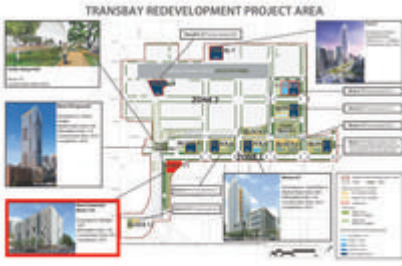
Measure 2 - First Image - Photo Credit: Office of Community Investment and Infrastructure