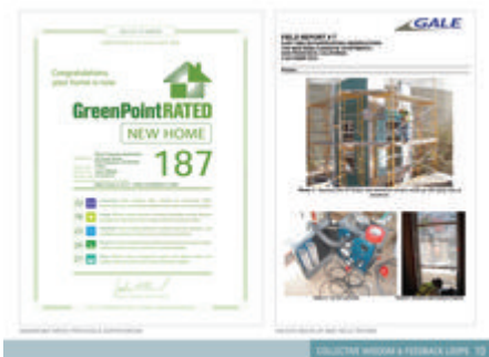
Measure 10 - First Image - Photo Credit: Build-It-Green + Gale Associates

Several strategies were used to model and evaluate the performance of the Rene Cazenave Apartments in addition to the design and construction tracking under the GreenPoint rating system commonly used for residential buildings in the Bay Area.