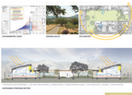
Psychrometric Chart, Site Analysis and Sustainable Strategies Section - Photo Credit: LMS Architects

The site is located in the warm, marine climate of the Northern California inland coastal region. The buildings are sited to optimize the passive benefits of daylighting, solar control, natural ventilation and cooling, and outdoor living. Due to the sensory sensitivity of the residents, climate control and comfort were critical aspects of the design. In addition to passive strategies the building envelopes were optimized to reduce energy loads through high-performance windows and enhanced building insulation.