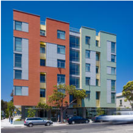
Merritt Crossing Senior Apartments

Located at the edge of Oakland's Chinatown, this new affordable senior housing transforms an abandoned site near a busy freeway into a community asset for disadvantaged or formerly homeless seniors while setting a high standard for sustainable and universal design.