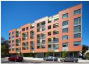
TOP: New high-density development at edge of eclectic mixed-use neighborhood; BOTTOM: Southwest facade with screen wall facing adjacent freeway