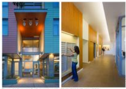
LEFT: Main entrance flanked by management office and community room; RIGHT: Main lobby with high-durability and renewable finishes