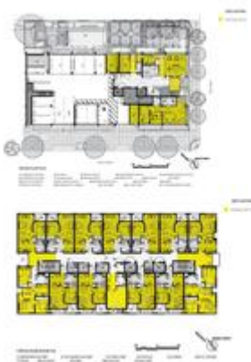
Daylight plan diagrams -