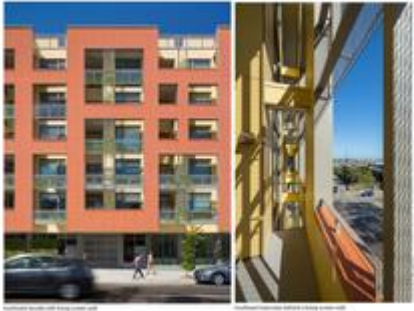
LEFT: Southwest facade with living screen wall; RIGHT: Southwest balconies behind a living screen wall